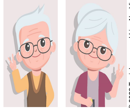
Old Man/ Woman